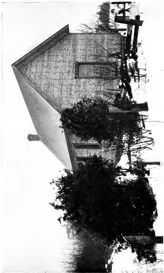
THE PLATT LAKE CHAPEL A Typical Preaching Place in the Larger Parish